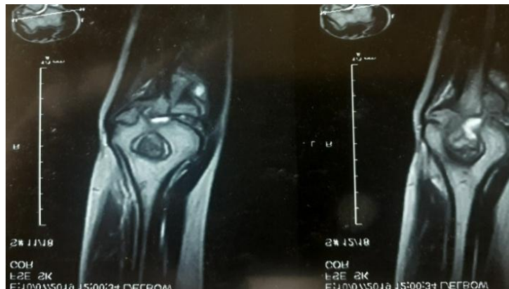
Fig. 3. Initial MRI of left elbow showing synovial enhancement, articular erosions, subarticular osteopenia and joint effusion