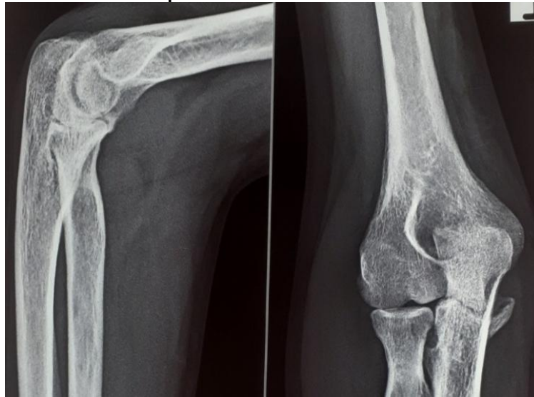
Fig. 5. 8 months follow up X ray of affected elbow of the patient with improved bony lesions