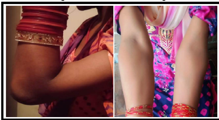
Fig. 2. Images showing improved range of 30 to 100 degree at 8 months of antitubercular treatment