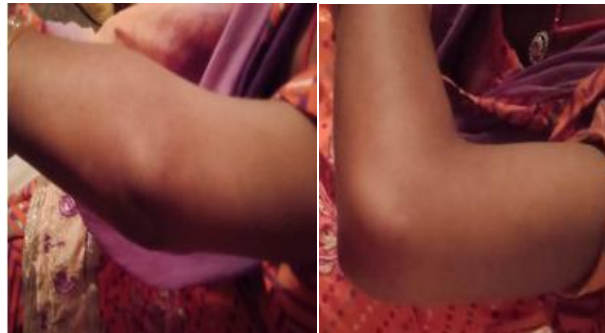
Fig. 1. Clinical photographs at the initiation of antitubercular treatment showing decreased range of motion from 70 to 90 degree