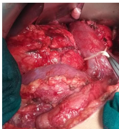
Fig. 2. Intraoperative view showing the vascular relationships where the mass is compressing the inferior vena cava and the right renal vein