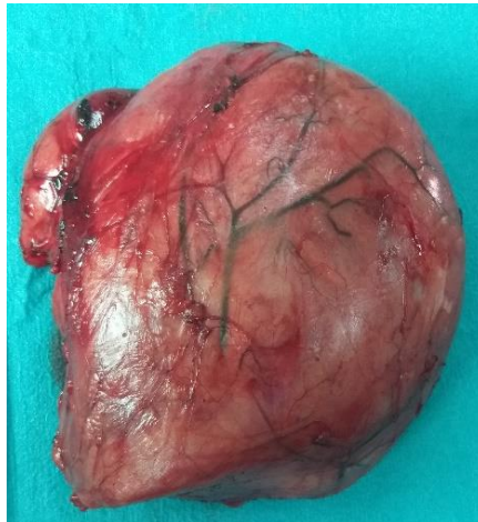
Fig. 3. Surgical specimen