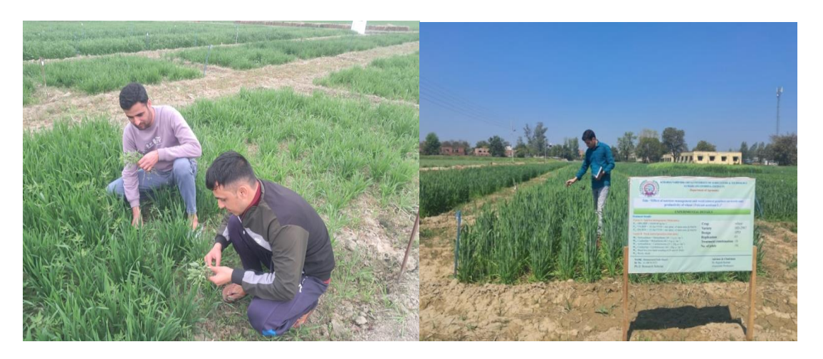
Fig. 2. Collecting and counting of weed flora from experimental field