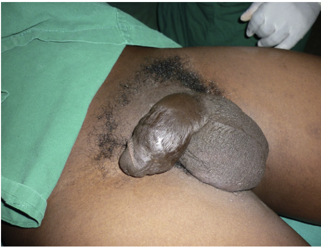
Figure 1 The phallus of the patient presenting 9 days after injury.

deviation during erection. Examination showed the presence of a palpable plaque in both patients.