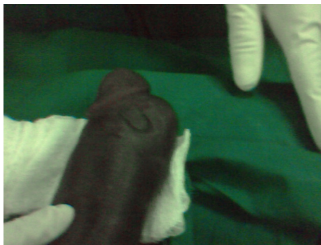
Figure 3 The phallus of the patient with a PF during oral sex.

Lagos will become the third largest city in the world (after Bombay and Tokyo) by 2015 [11]. The rapid increase in population and the increase in the cosmopolitan nature of the society are more likely to increase the number of sexual encounters, increase more liberal attitudes toward sex, and the reporting of sex-related medical problems.