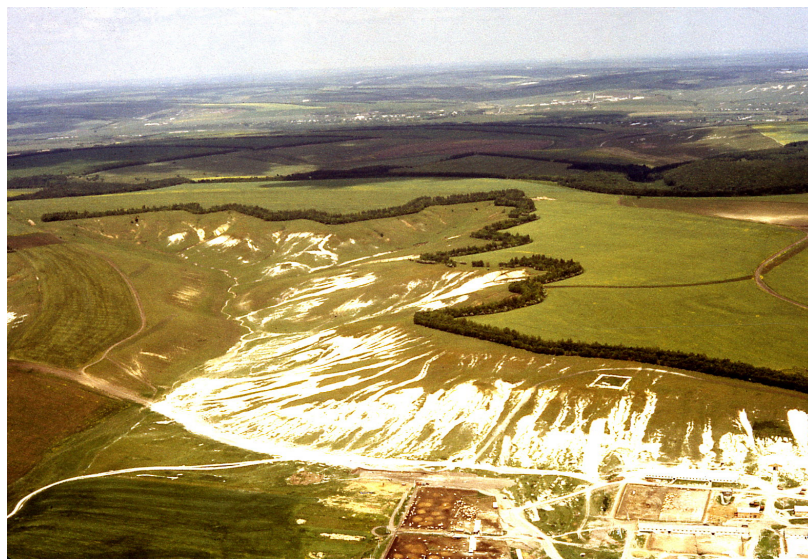
Figure 1. Before development of landscape agricultural systems (1979)

The great contribution in working out theoretical bases of landscape agriculture was brought by the academician of Russian Academy of Agricultural Sciences O.G. Kotlyarova, under her guidance a large-scale development of landscape agricultural systems was carried out in Krasnogvardeiskiy district of Belgorod region (Figures 1 and 2).