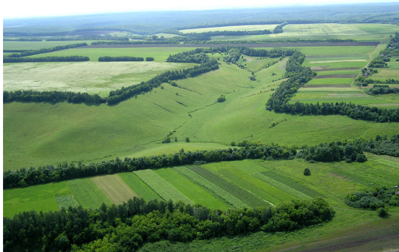
Figure 2. After development of landscape agricultural systems (2008)

The landscape agricultural system's elements are an organization of land-use, differentiated location of crop rotation of different soil protection direction, soil protection technologies of crops and systems of machines, forest improving, meadow-improving, hydraulic and other activities. The key moment and the basis for the whole complex of soil protection activities become erosion-preventive territory organization, as it includes territory typification and marking of agrolandscape stripes by homogeneous agriculture ecological conditions, erosion rates, angle slope and pattern of use. Allocated agrolandscape strips characterize 4 modules of landscape agricultural systems: intensive (intensive technologies, intensive crop rotations with saturation of row crops, intensive sorts, etc.), soil protective (excluding the use of row crops), biological (with the saturation of perennial grasses from 50 to 100%) and remediation (solid grassing, continuous afforestation, flattening of the ravine, etc.).