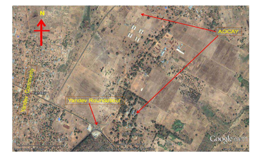
Fig. 2. Google earth image (2012) of AOCAY