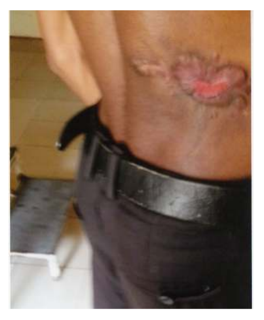
Fig. 5. A male with recurrent keloid right lower back and skin excoriation from intralesional triamcinolone injection

Patents were also treated for pruritus with antihistamines like promethazine and chlorphenyramine. A great percentage of our patients (thirteen in number constituting 41.9%) complained of pruritus and pain because of their keloids and many had psychosocial problems due to the unsightly scars. All patients wanted treatment to improve their appearance.