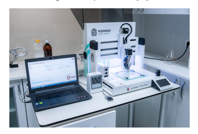
Fig. 3. FabRx's pharmaceutical 3D printer for personalized medicines, M3DIMAKER [21]

approaches due to its many inherent advantages over the conventional technologies, and individual customised formulation with adjusted dose, fabrication of highly accurate solid dosage forms on-demand manufacturing, more mechanised, quick and simple to use, and cost-effectiveness. This is supported by various scientific databases, including Scopus, MEDLINE, EMBASE, and Pub Med" [18].