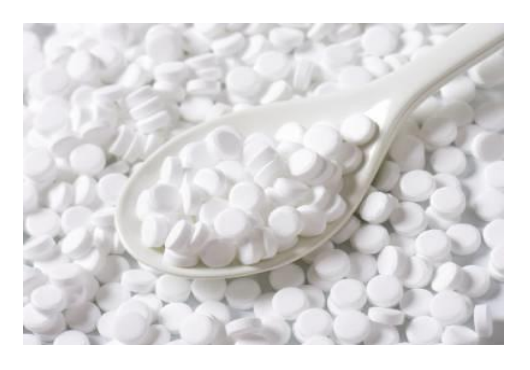
Fig. 1. Mini tablets

Orodispersible films are thin sheets of polymer, either single- or multi-layered, that dissolve rapidly in the mouth before swallowing. While not explicitly mentioned in the EMA pediatric guideline, the scientific literature increasingly discusses their appropriateness for pediatric drug therapy [13]. The main advantages of these films are their ease of administration, ability to measure dosage accurately, limited risk of spilling, absence of choking hazards, and the ability to cut them into different sizes for dosing flexibility during product manufacturing. However, factors such as patient acceptance, product strength, packaging, and the risk of medication errors associated with the use of this dosage form require special attention.