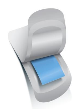
Fig. 2. Orodispersible film [17]