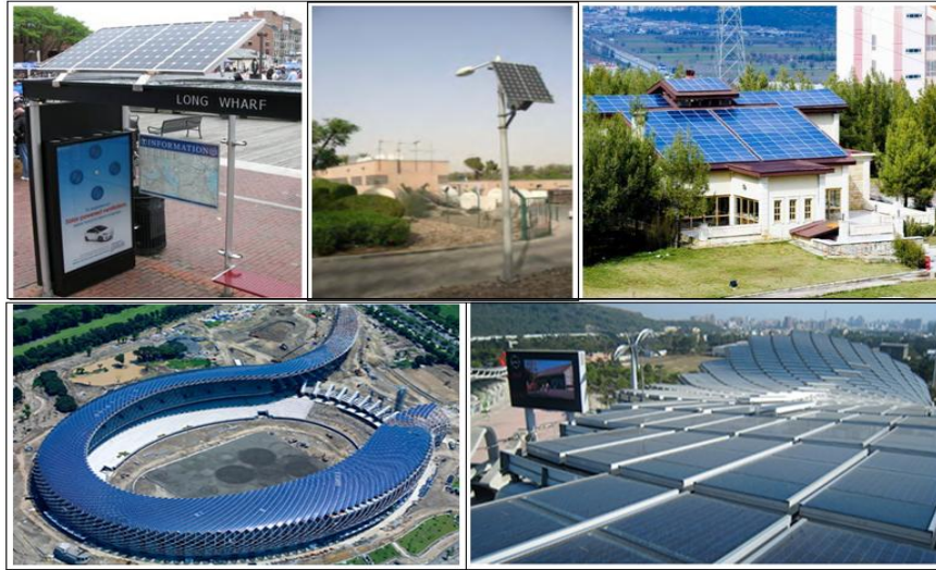
Fig. 3. Other implementation areas

40-year-old mature trees during their entire lifetime [30].