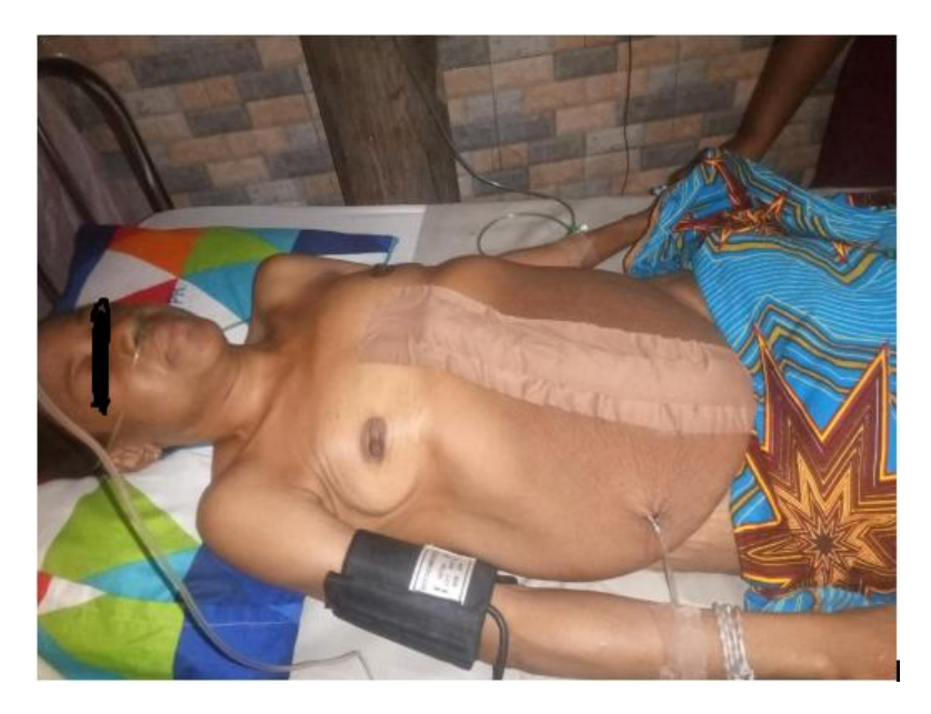
Fig. 3. Immediate post operative period of the patient

"Giant intra-abdominal cysts have become comparatively rare because of advances in healthcare systems" [7]. "Mesenteric cysts in particular have a low global incidence of approximately 1 out of 100 000 adults seeking medical care, and they primarily affect people in their second to third decades of life with a maleto-female ratio of 2:1" [6]. Mesenteric cysts represent 7 % of all abdominal cysts and can