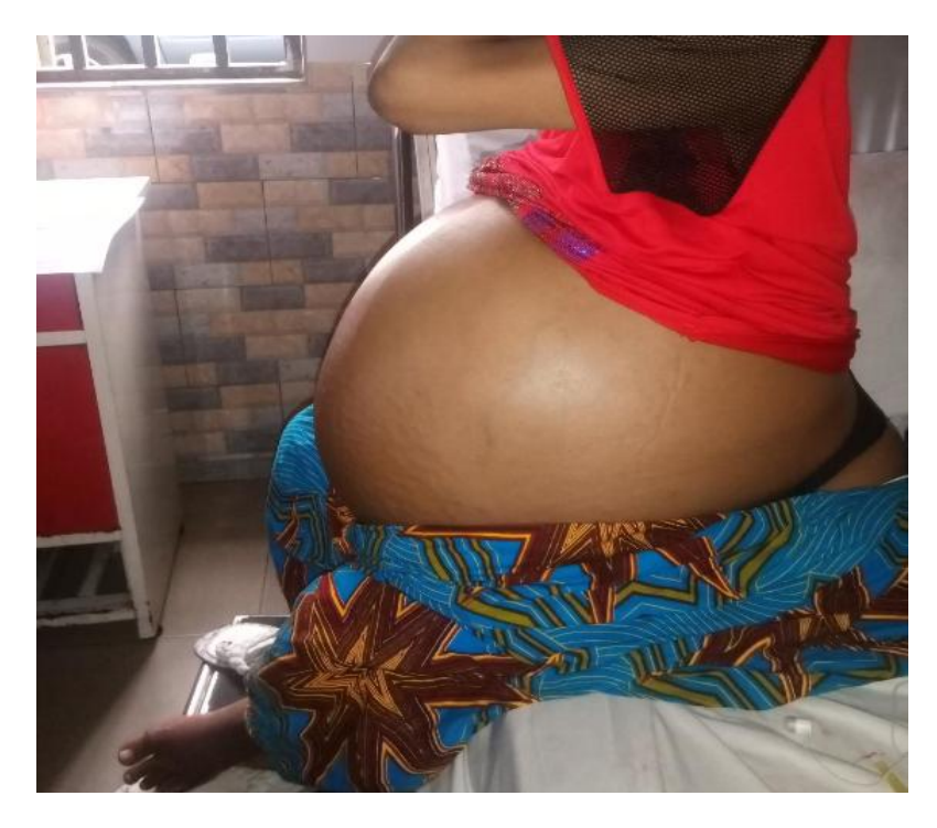
Fig. 1. Patient's abdomen: gross abdominal distension with visible collateral venous circulation

Dienye et al.; Asian J. Case Rep. Surg., vol. 17, no. 4, pp. 1-7, 2023; Article no.AJCRS.97436