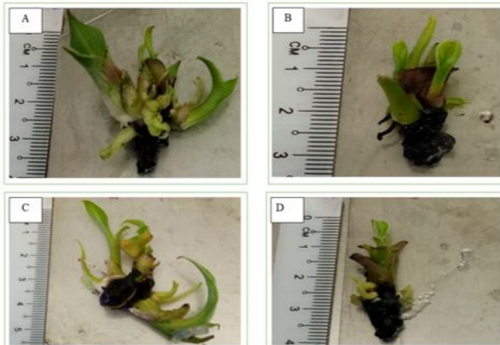
Figure 3: Effect of different doses of \gamma rays on the number of shoots of banana cultivar Tanduk in 2 nd sub-culture generation (A: Control), (B: 10 Gy), (C: 20 Gy) and (D: 30 Gy).