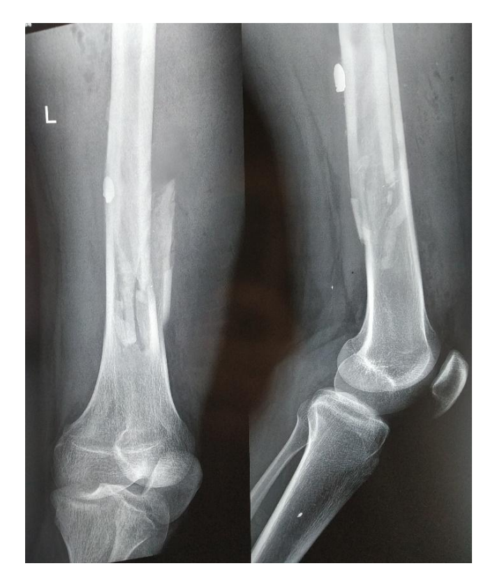
Fig. 1. Pre operative X ray AP and lateral view