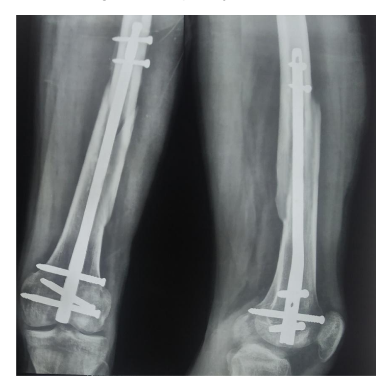
Fig. 5. Follow up X ray At 24 weeks