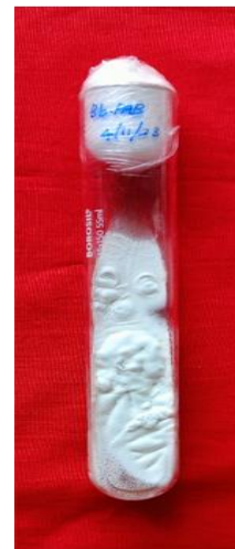
Fig. 1. Slant culture of B. bassiana

Sesamum oil) and 2 mineral oils (Heavy grade Mineral oil, Liquid paraffin oil). Saboraud's Dextrose Agar with Yeast Extract Medium (SDAY) was prepared, poured into test tubes, autoclaved at 121^{\circ}\text{C} at 15 Psi for 15 minutes and made as slants. After slants got cooled down, discs or loop of spores and mycelia of laboratory-maintained culture of B. bassiana were inoculated into slants under aseptic condition and incubated at 25 \pm 2^{\circ}\text{C} temperature. Ten to twelve days after inoculation, satisfactory growth and sporulation of B. bassiana were obtained in almost all slants (Fig. 1). Each fungal slant was poured with autoclaved vegetable and mineral oils viz. , Rice bran oil, Sesamum oil, Mineral oil and Liquid paraffin oil respectively until the entire fungi grown in slant media got submerged with oil (Fig. 2).