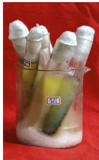
Fig. 2. B. bassiana oil cultures