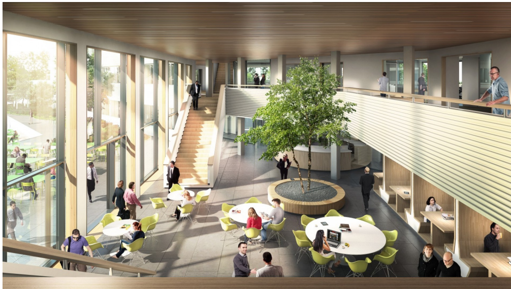
Figure 4. Example of a dynamic working environment ( http://www.kraaijvanger.nl/image/1/0/1080/0/uploads/project-afbeeldingen/3121_84_n9_medium-545b763ad6bae.jpg ).

place environment and design (e.g. separate printer room, promotion of stair use, provision of a ping-pong table) or changes in the design of office desks (e.g. use of sit-stand tables, ergobikes, treadmill desks). A lot of new devices are coming into the market. The effectiveness of these interventions is a popular theme in recent research. A recent review study [24] revealed that sit-stand desks can reduce sitting between a half to two hours per day. Also people will reduce their sitting periods lasting longer than 30 min. However, one study analysed the effects after 6 months and found that sitting was reduced with less than one hour. This is considerably less than the 2 till 4 hours that is promoted by an expert guideline (Buckley et al. , 2015). So it is extremely important to focus on strategies to promote behaviour change to reduce our sitting behaviour. Also, standing alone is not enough to have sufficient change in your energy expenditure during the day, therefore it is recommended not only to break sitting with standing periods, but also to move more during work.