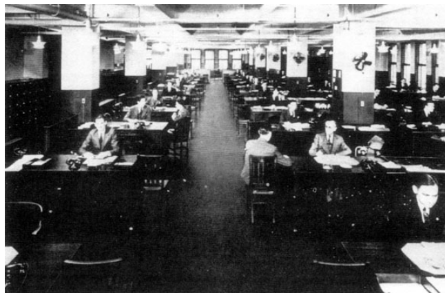
Figure 1. Set-up of office workstations during the industrial revolution http://www.carusostjohn.com/ .

In Germany, they decide to divide the open plan model with screens, walls and plants to create differentiation and privacy (for an example, see Figure 2 ). Carpet and absorbing ceilings had to reduce the noise level. Advantages