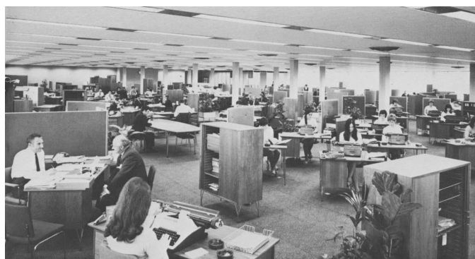
Figure 2. First version of an open office plan (Brookes, 1972) [7].