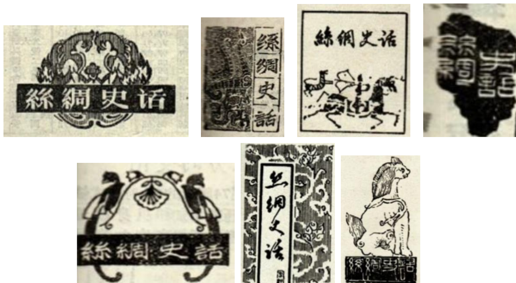
Figure 4. The "Silk History" column logo of Journal of Silk in 1964