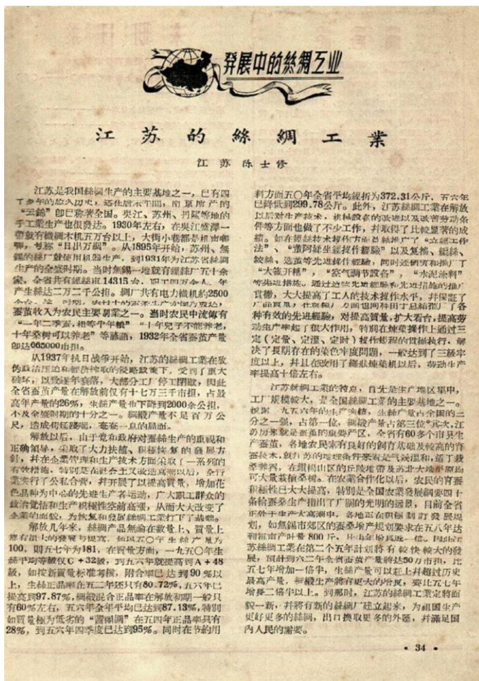
Figure 1. The first historical theory paper in Zhejiang Silk Industry News