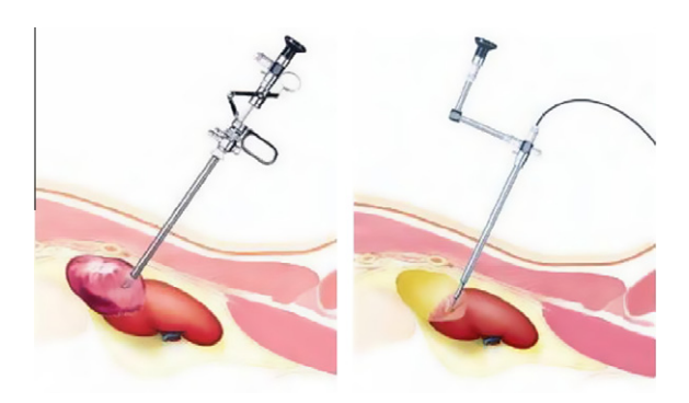
Figure 2 PU of a simple renal cyst using a resectoscope.