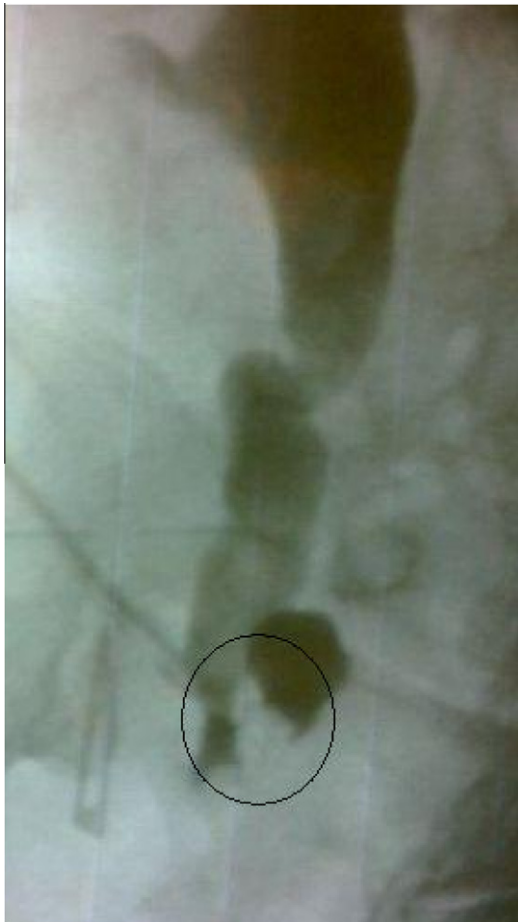
Figure 1 Nephrostogram to visualize the position of the stricture marked with a circle.

Under general anaesthesia, the patient is placed supine as for percutaneous nephrolithotomy (PCNL), with a 10–15° tilt of the ipsilateral trunk. Percutaneous renal access is obtained by standard PCNL techniques, and a nephrostogram taken to confirm the position and length of the stricture (Fig. 1). A guidewire is inserted via the percutaneous tract through the stricture and externalised through the conduit using the flexible cystoscope, leaving a ‘through and through wire’.