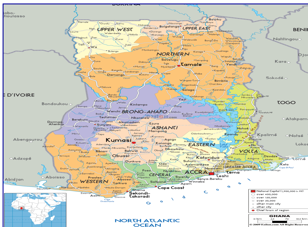
Figure 1. Administrative map of Ghana (Ghana Statistical Service, 2011)

Council for Agricultural Research and Development (CORAF/WECARD) and implemented in Ghana by CSIR-SARI (Council for Scientific and Industrial Research). A map of the study area is shown in Figure 1 below.