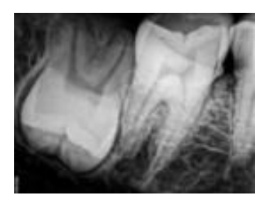
Fig. 2. Impacted molar of fourth quadrant

Root canal treatment was performed with the second molar of the fourth quadrant and final scan was done using Cone Beam Computed Topography (I-CAT).